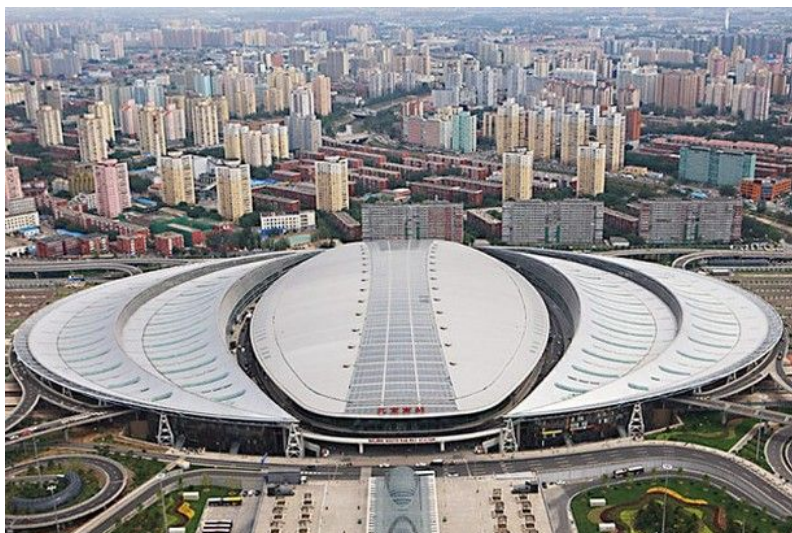
Figure 4 - Beijing South HSR station highlights the importance of HSR in China, which now has 40,000 km of HSR lines.