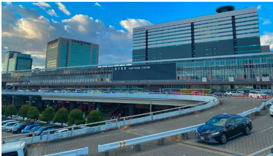
Figure 3 - Shin Osaka, dedicated HSR station located 3 km from Osaka's conventional railway station, created a new urban centre close to the city's traditional transport hub serving local and suburban rail passengers.

Other countries, including Japan, China, France and Spain, have located purpose-built HSR stations close to existing conventional passenger rail stations or in new suburban locations. These stations enable planning and delivery agencies to re-structure urban development, avoid expensive redevelopment of conventional station precincts, and better distribute travel patterns within metro regions. For example, new out-of-centre HSR stations have been built in cities such as Osaka, Beijing, Madrid and Shanghai.