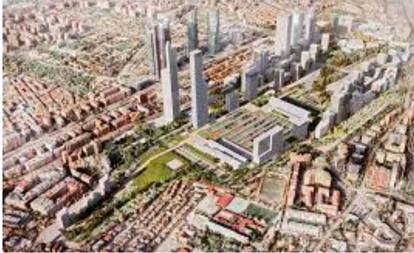
Figure 5 - Madrid's Charmartin HSR Station serves northern HSR lines and is being connected to Atocha Main Rail station via a new rail tunnel.

It is vital that both the NSW and Federal Governments take advantage of the Rosehill opportunity both for Metro West and the immediate housing needs of Sydney, and for the HSR and the longer term decentralisation benefits it can bring. This is truly a game -changing opportunity.